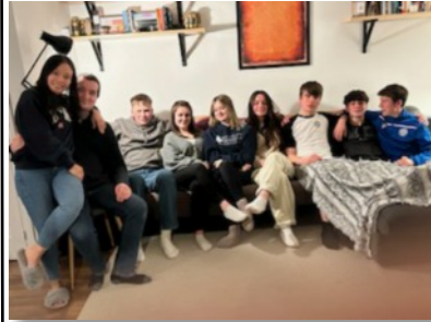
Youth Alpha team 2023

After that we're finished until after the summer, so starting back on 1st September.